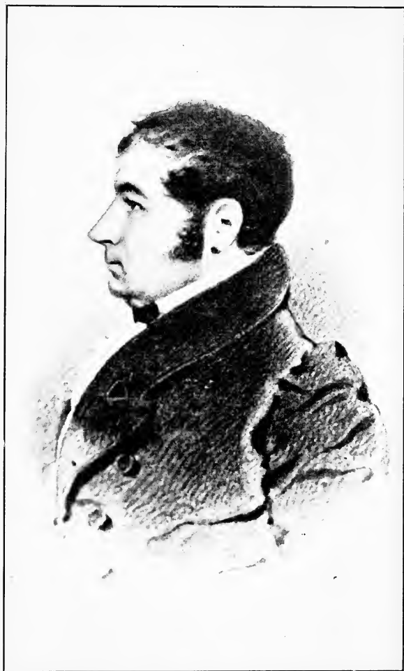
JOHN PAULDING Born 1758 — Died 1818 From a miniature